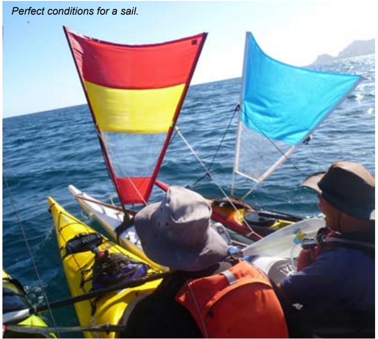
Perfect conditions for a sail.