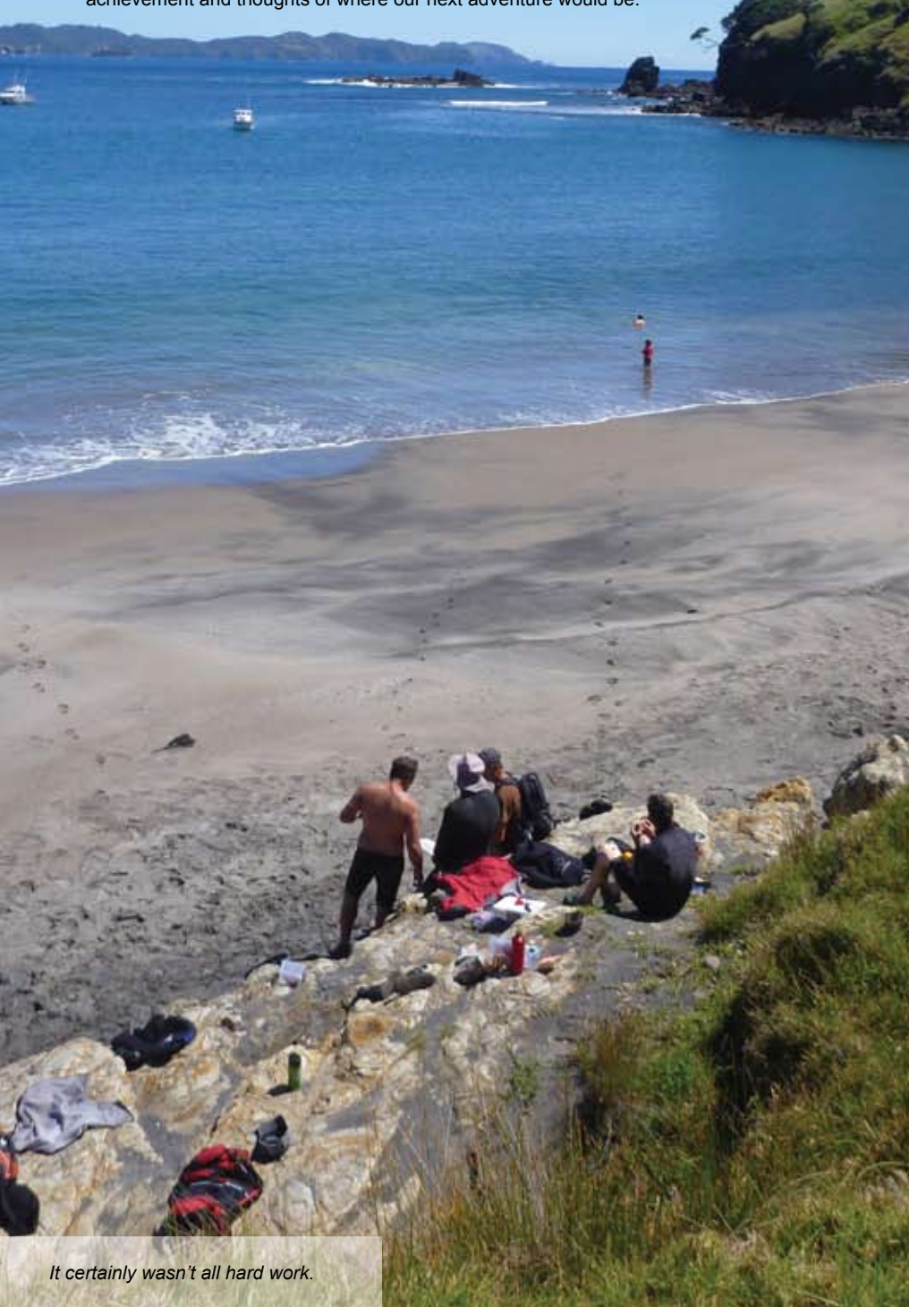
It certainly wasn't all hard work.

We woke weary to an overcast day and the decision was made to take the window of opportunity and make a run for Fletcher's Bay — a good 31 kilometres away. We were confronted with 30 knot winds and 3 metre breaking swells, but the tide was with us and the wind was on our starboard aft quarter. In high spirits and close formation we set to the task at hand arriving on the beach of Fletcher's Bay in torrential rain, but with a sense of achievement and thoughts of where our next adventure would be.