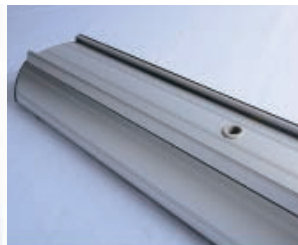
HIDDEN CENTRAL POLE