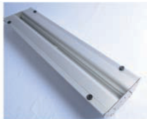
ADJUSTABLE FEET (for un-level floors)