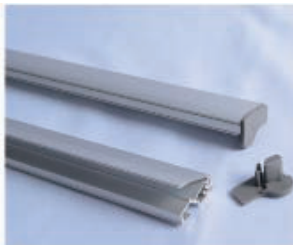
EASY FIT TOP BAR