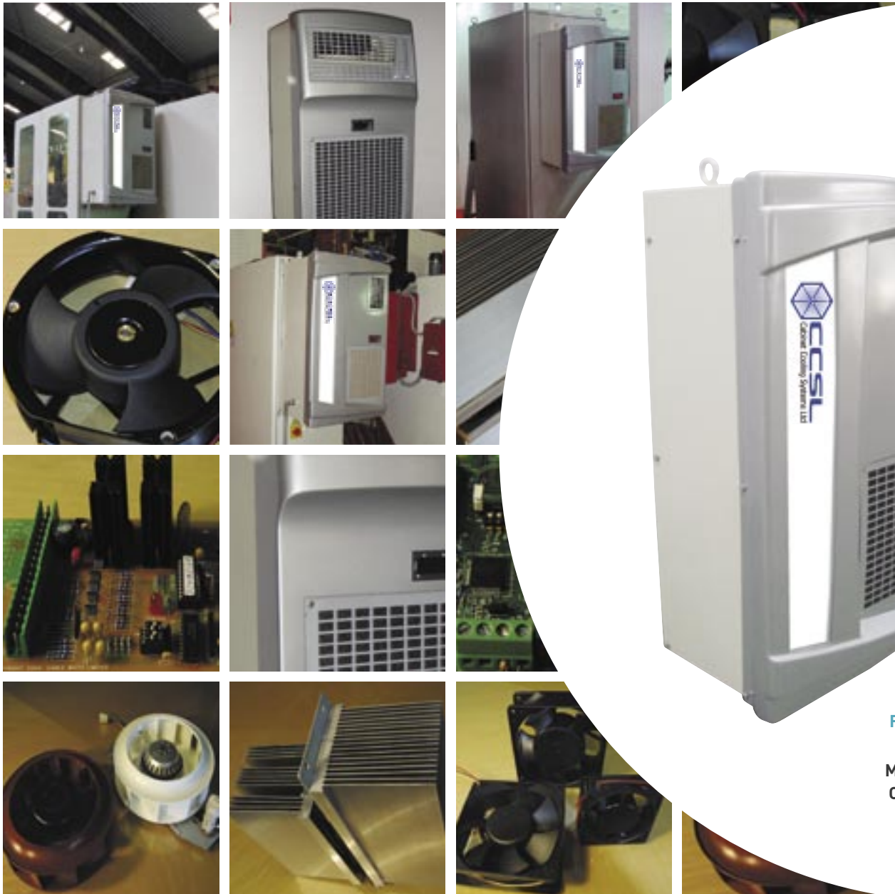
FEATURED: 1Kw Panel Mounted Air Conditioner

TEC coolers, allow active cooling without moving parts. Being solid state devices they offer long service intervals and have a very low environmental impact.