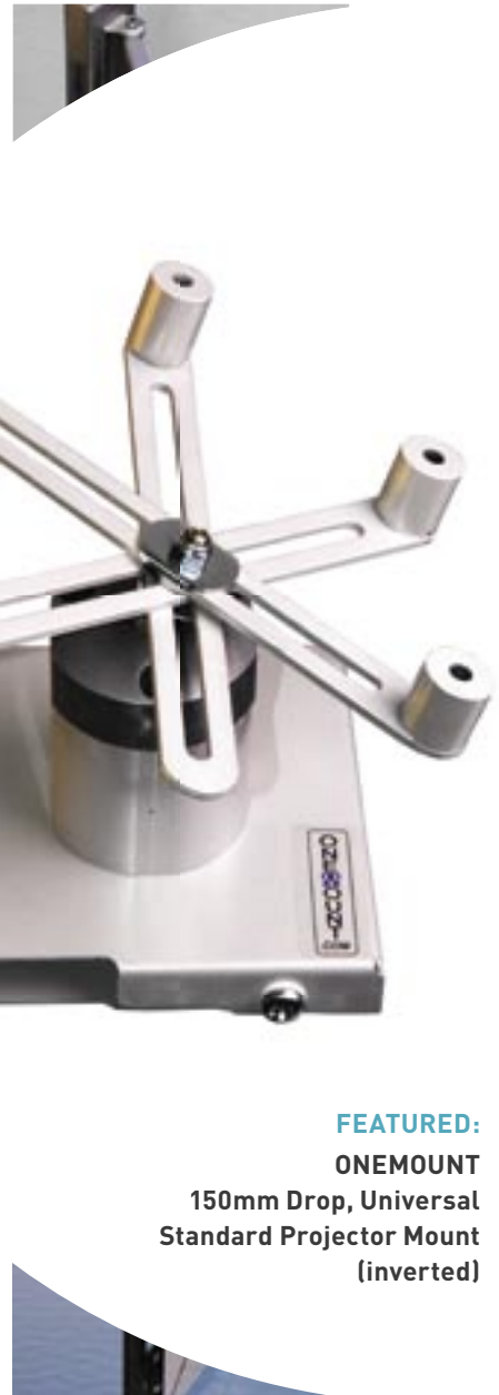
FEATURED: ONEMOUNT 150mm Drop, Universal Standard Projector Mount (inverted)