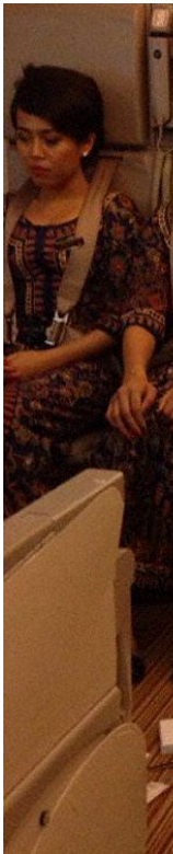
Infrared Image May 06:00Z

Scenes on board shortly after the encounter: