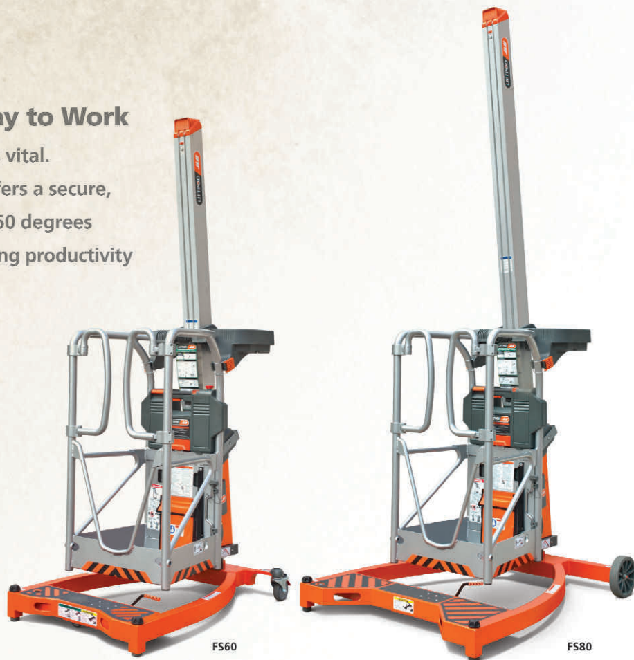
Shown with optional Power Pack Kit.

One-fourth the cost of traditional work platforms, the LiftPod continues to pay for itself, year after year, use after use.